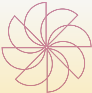
ILLUSTRATION – ‘TRIGGERS AND TIPPING POINTS’